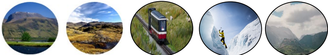
Ben Nevis Scafell Pike Snowden Everest Skiddaw

1. Some of these are mountains in the UK. Which one is the odd one out?