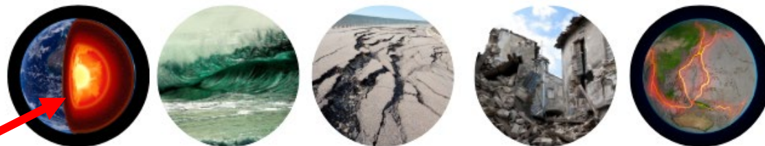
crust tidal wave after shock rubble tectonic plates

4. Some of these are linked to earthquakes. Which is the odd one out?