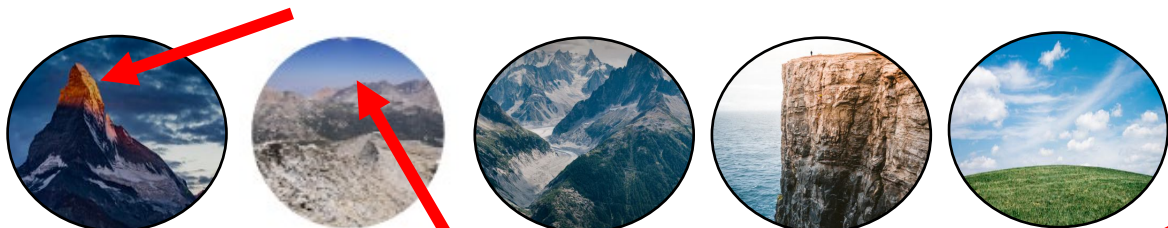
peak ridge range cliff hill

2. Some of these are parts of a mountain. Which one is the odd one out?